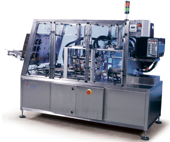
Tray Erector TR201

Features: Stainless Steel Construction AC Variable Frequency Drive Auto/Manual Operation Quick Change Touch Screen Operation Panel Pressurized Hot Glue System