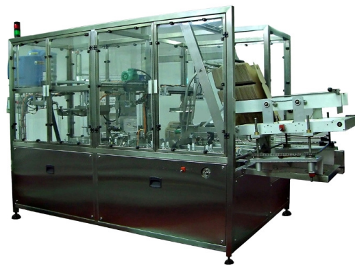
Carton Wrapping Machine CRW6K

For Complete Info, Specs and Photos: Email: info@alpinemachinery.com