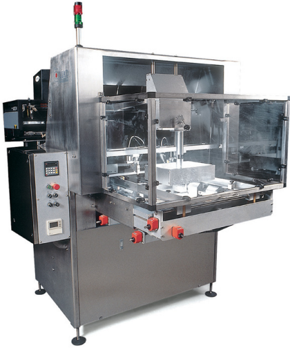
Tray Erector TR10/TR11

Features: Stainless Steel Construction AC Variable Frequency Drive Auto/Manual Operation Quick Change Touch Screen Operation Panel Pressurized Hot Glue System